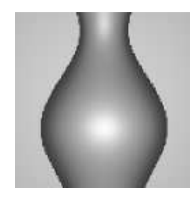
Figure 1: Synthetic vase input images. Left: Lambertian surface. Right: Phong-type surface.

PF algorithm, as the sweeping scheme was not previously applied in that context. In doing this,